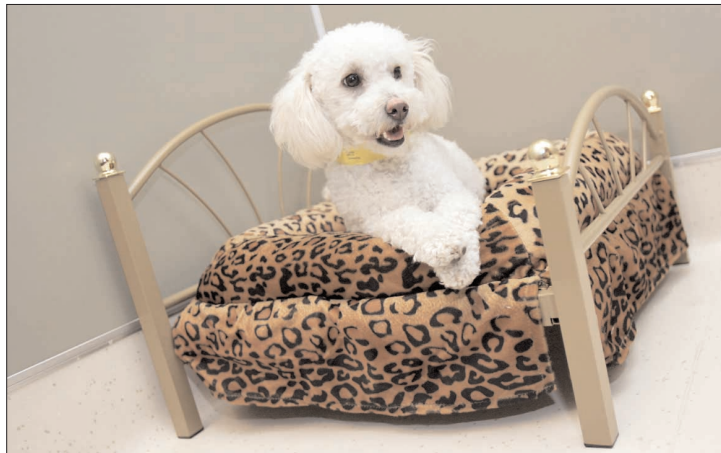
It truly is a dog's life for Mickey, who almost appears to be smiling while enjoying a little relaxation on a dog bed in one of Paws Crossing's deluxe suites.

Cats, meanwhile, have their own playspace in "Kitty Garden Terrace." The cats stay in compartments fitted with their own